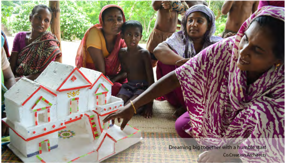
Dreaming big together with a humble start Co.Creation.Architects

Being local helps our endeavour. Jhenaidah is our home town; we are more than just architects here. We have many other intersecting identities as human beings. Presence with our multiple identities can liberate us and others to build better and stronger relationships. Our starting point was connecting with people: local authorities, local facilitators and collaborators, and similar minded people. We shared our beliefs with them. Simultaneously, through direct action with low-income communities, we appropriated our skills and roles. Our chosen path is not always smooth and without challenges, but we have discovered that finding the right questions is more important than getting all the answers. Identifying what the real problems are is very important.