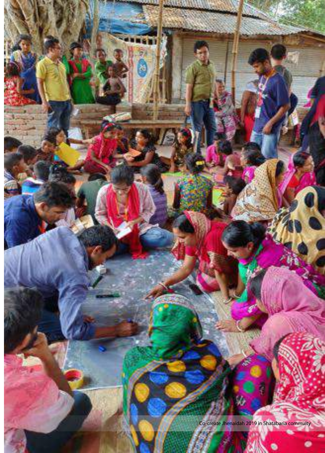
Co-create Jhenaidah 2019 in Shatabaria community

When we think of a city, we often focus on our role: us as individuals, our communities, our society. It's easy to forget there are other living elements both visible and invisible who form an integral part of our society. These are things like nature, traditions, beliefs, relationships, feelings, or even energies. These components also need to be well taken care of, meaning that we as human beings need to incorporate, respect and understand that they are fundamental to our well-being, both now and in the future.