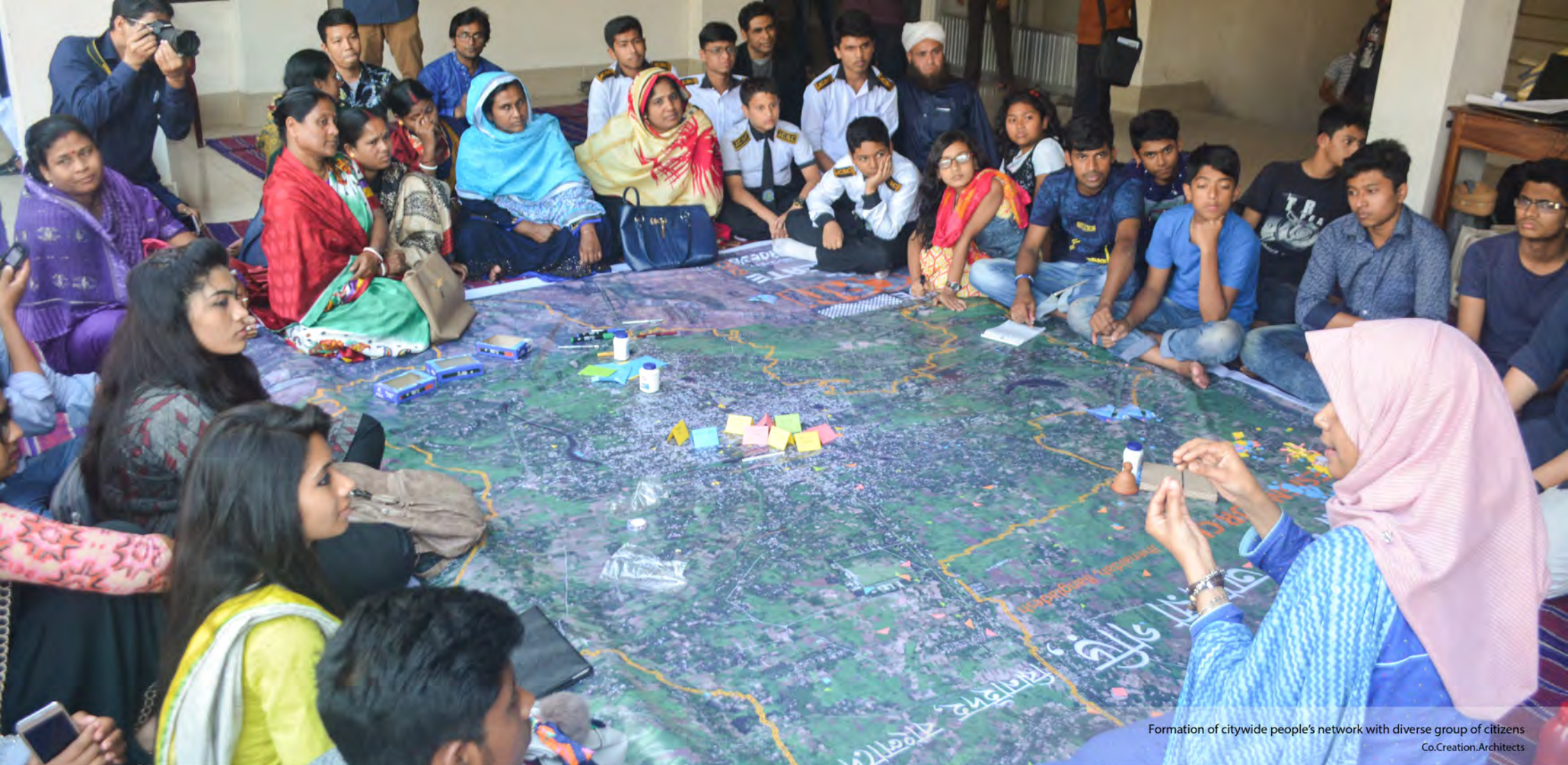
Formation of citywide people's network with diverse group of citizens Co.Creation.Architects