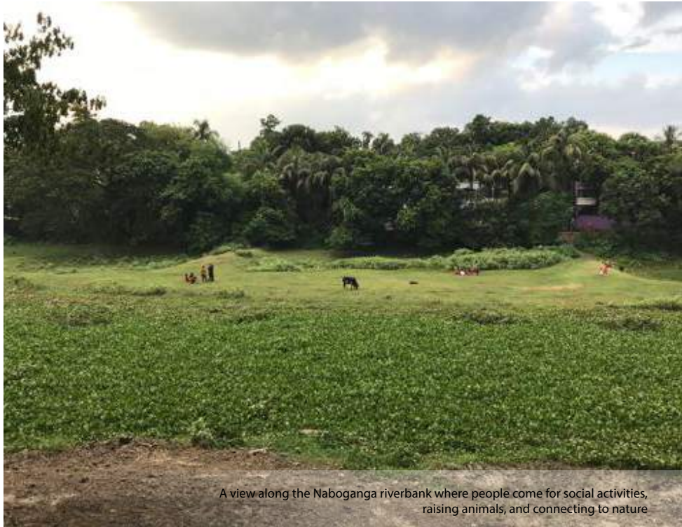
A view along the Naboganga riverbank where people come for social activities, raising animals, and connecting to nature

As a process, co-creation embraces all possibilities. Chaos is welcomed ; and so is standing still, unmoving. People are encouraged to be playful to discover the edge between what is already known and the unknown. This playfulness leads to innovation and the birth of new and creative ideas. Everyone should have access to the entire system, leading to astounding levels of high quality of communication. Through this process, our consciousness gets lighter; once that is achieved, each individual begins to co-create in the new system.