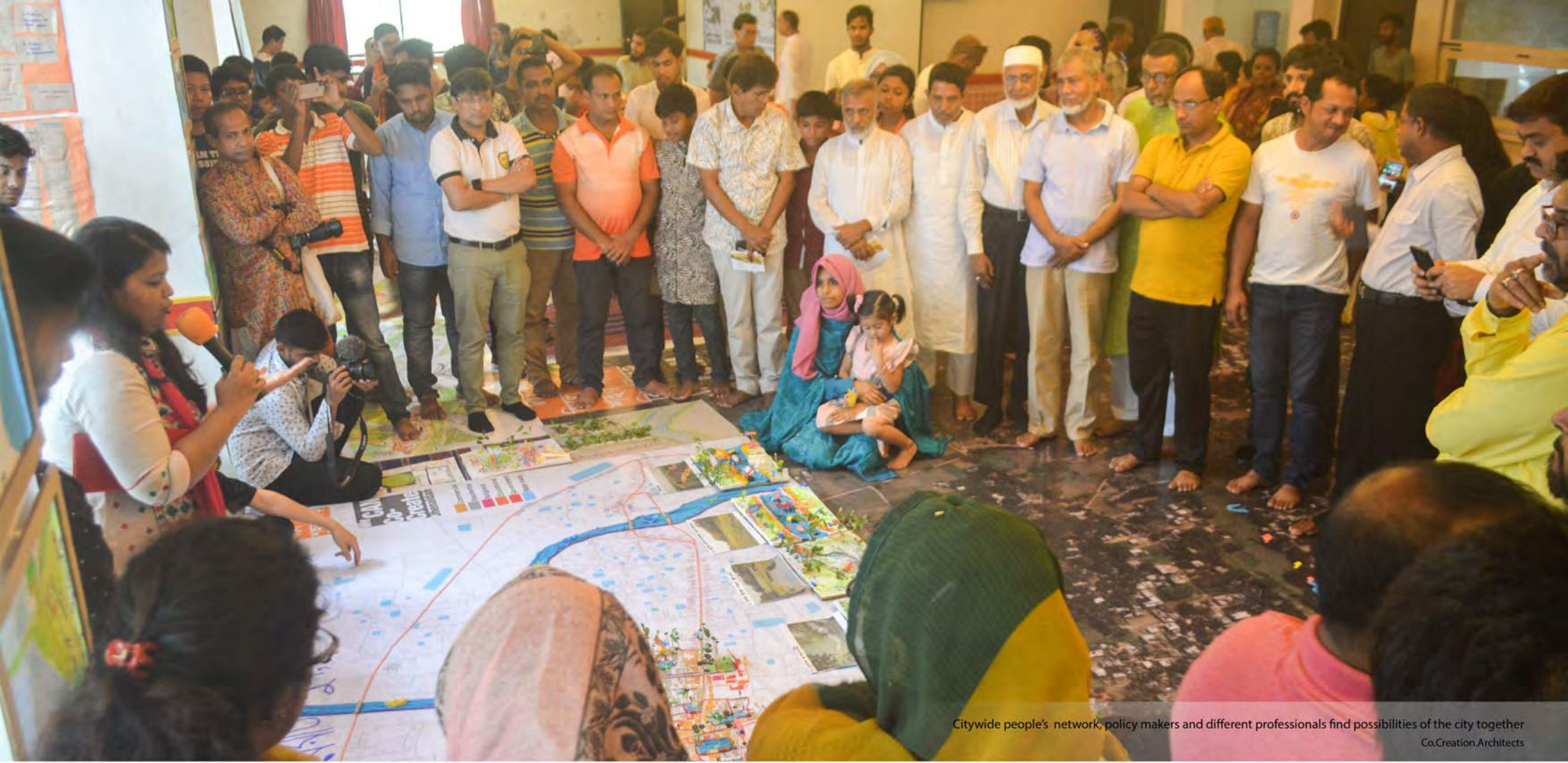
Citywide people's network, policy makers and different professionals find possibilities of the city together Co.Creation.Architects