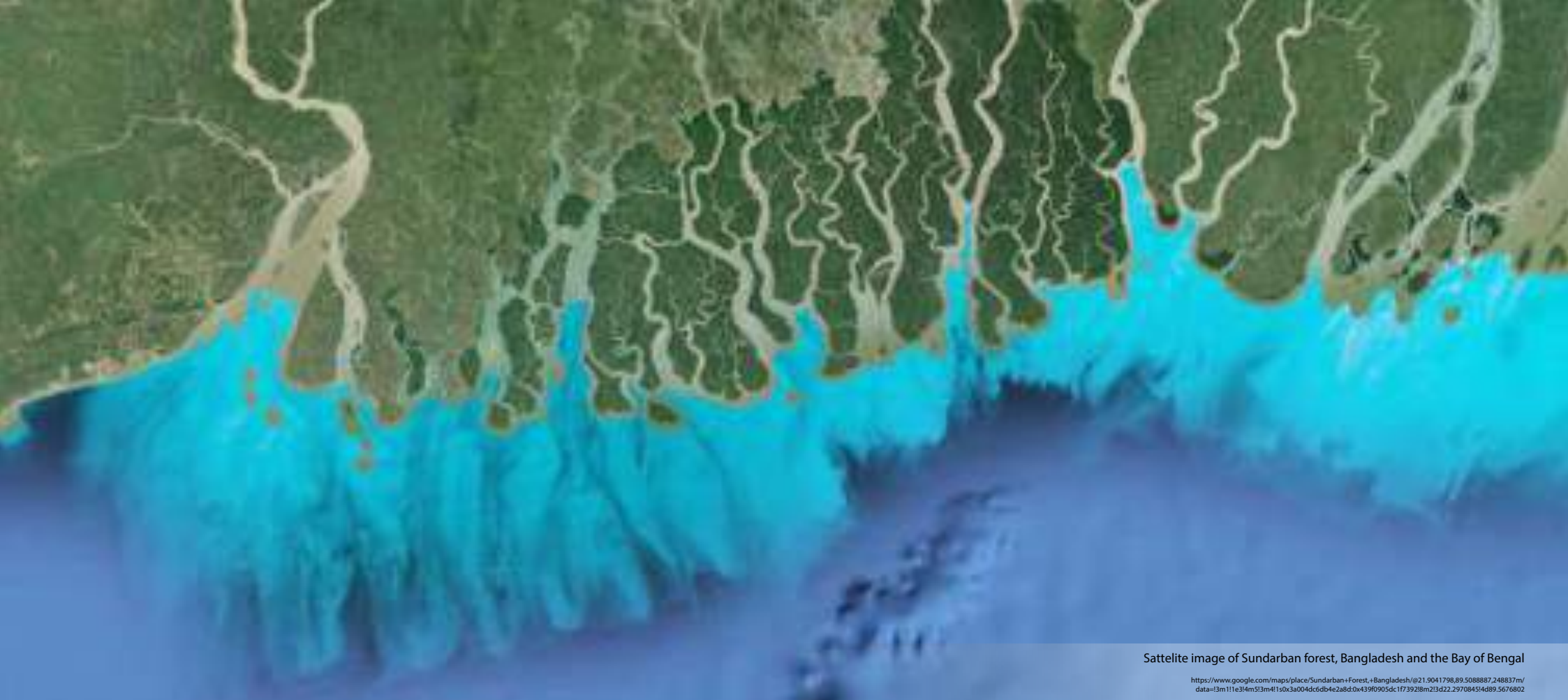
Satellite image of Sundarban forest, Bangladesh and the Bay of Bengal

https://www.google.com/maps/place/Sundarban+Forest,+Bangladesh/@21.9041798,89.5088887,248837m/data=!3m1!1e3!4m5!3m4!1s0x3a004dc6db4e2a8d:0x439f0905dc1f73928m2!3d22.2970845!4d89.5676802