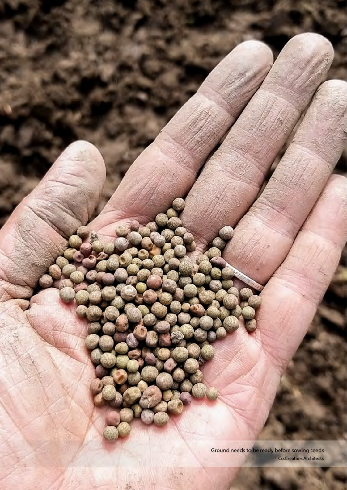
Ground needs to be ready before sowing seeds Co.Creation.Architects

As in nature, the seed of co-creation needs an appropriate and enabling environment to grow, as well as passionate gardeners to nurture it. As architects, we placed ourselves in this situation and asked ourselves: what can we do and where do we fit in? We felt the need to start a humble architectural practice named Co.Creation.Architects with an intention to work with both human and non-human communities.