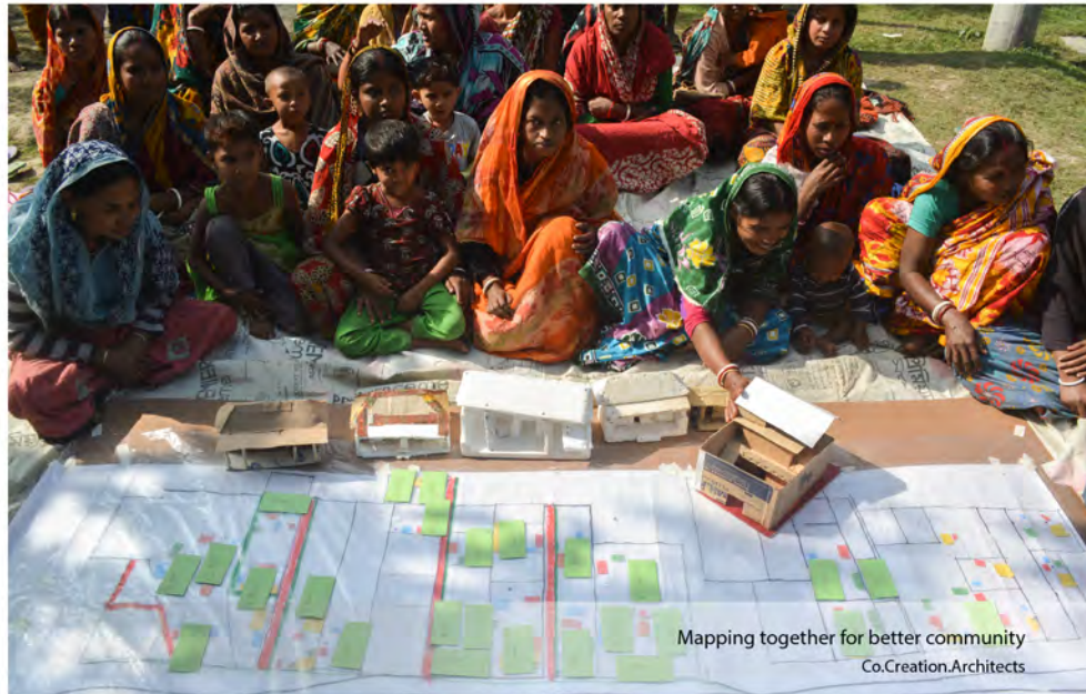
Mapping together for better community Co.Creation.Architects

To understand and explore the above questions, the people of Jhenaidah Municipality have joined one another in groups from different backgrounds, with different names, eager to rethink their city. The emerging "Jhenaidah Citywide People's Network" is an apolitical, flexible and organic network based on trust and a desire to improve the city. By using a collective decision-making process, citizens unlock their potential and all groups achieve higher levels of satisfaction.