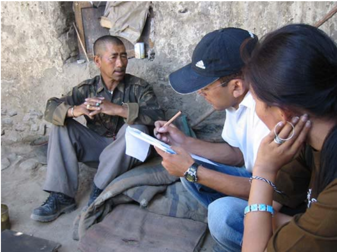
Above: THF social study of the old town, interview with residents. Right: emergency repair on 17th century Lonpo house, now owned by a monastery. Below: there are numerous stupas and shrines and chapels located within the old city area. Shown here the Guru Rinpoche Lhakhang.