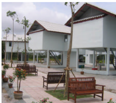
▲ BEFORE :