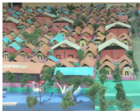
▲ AFTER :