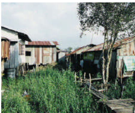
▲ BEFORE :