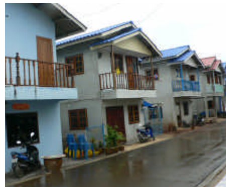
▲ AFTER :