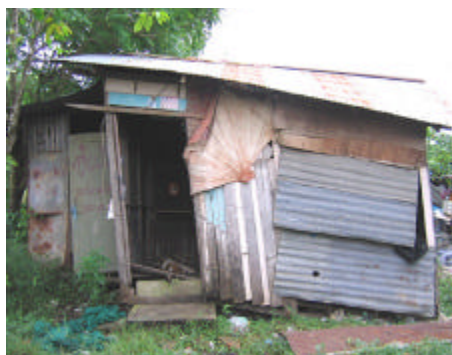
▲ BEFORE :

EVERYONE LEARNS : The municipality was very uncertain about this project at the beginning. Little by little, the mistakes were corrected and problems that occurred in the process early on were corrected. Later, the people started manufacturing building materials and the houses got better and cheaper. Knowledge accumulated and the quality went up and up. And other communities also learned.