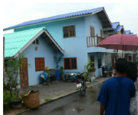
▲ AFTER :